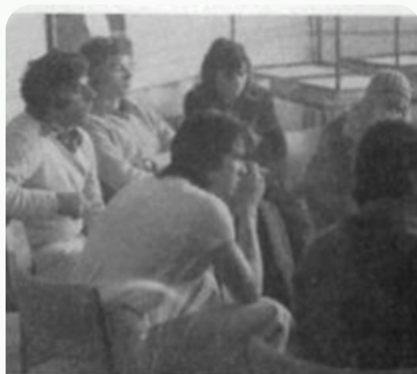
Group discussion at Western Youth Welfare Service, Ascot Vale.