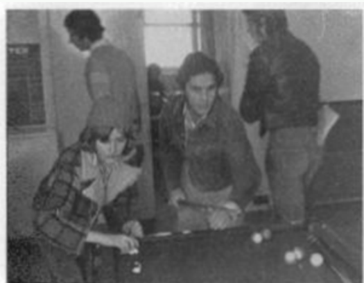
Pool receives concentrated attention at Ascot Vale.