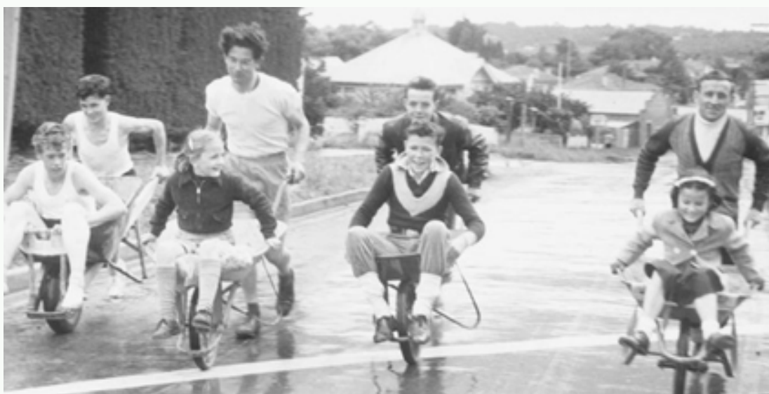
Youth Workers push young people in a wheelbarrow race at Heathmont Youth Club